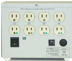
Rear view ILc-1400Med4