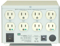
Rear view ILc-1000Med4